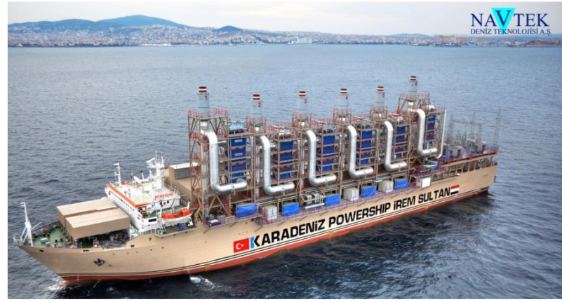
Figure 3 Irem Sultan designed by NAVTEK and operated by KARADENIZ Company

After completing the manufacturing work, tests and trails as well synchronization are performed in an order. The Floating Power Plant shall be ready to sail to the final destination. As per the Ship has all certificates allowing her to ocean-going voyages, the Floating Power Plant shall sail herself to the Site she will be running. After the Floating Power Plant has arrived the running site, she will be moored & anchored and Shore Grit Electric Connections shall be completed. A sample designed by NAVTEK and operated by KARADENIZ Company can be seen in Figure 3.